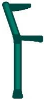
CRUTCHES/ WALKING AIDS