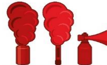
SMOKE CANISTERS/FIREWORKS/ FLARES AND AIR HORNS