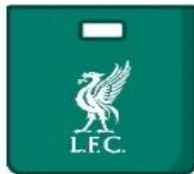
RETAIL PURCHASES IN RETAIL CARRIERBAGS