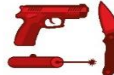
KNIVES/WEAPONS AND LASER DEVICES